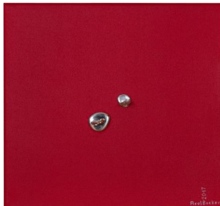
Axel Becker, Soldi per niente 1 (Money for nothing 1) , mixed media