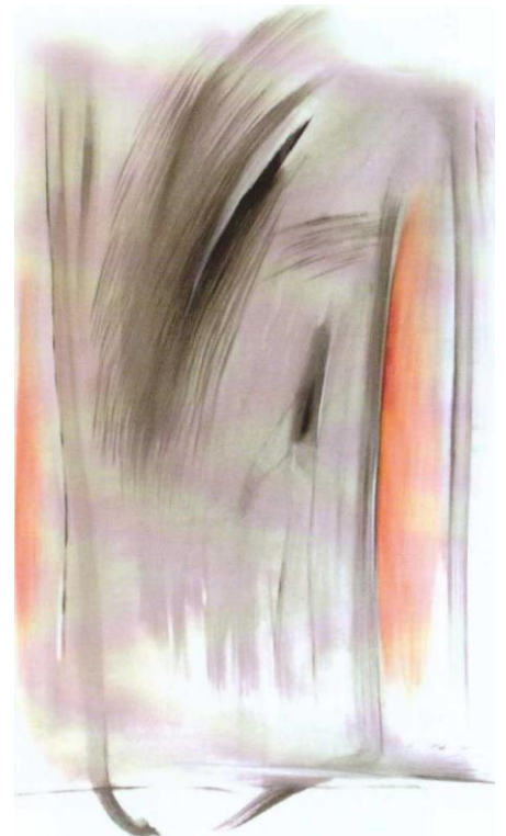
Mirta Diminić, Quando arriva il momento (When the time comes) , mixed media

The exhibition, which will be officially opened on Saturday, October 13, and held until October 30, will be open for visitors every day from 11 am to 1 pm and from 4:30 pm to 7:30 pm, except Sundays and Monday mornings.